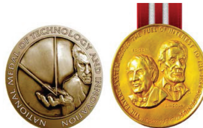
National Medal of Technology &amp; Innovation and National Hall of Fame Medal

One of my goals as the Chair of the Section has been to create events that provide you with return on investment on your dues! In order to better serve your needs, I am going to employ a "voice of the customer" approach in creating activities for the Section. This is your chance to have a voice in telling us how the Rochester IEEE Section can better serve your needs as a member. Every month, I will post a poll in this email distribution that provides optional events for the following month. Rank these events!!!! The results of the poll will be conveyed the following month. The most popular choice will be pursued the following month -- if the resources are available.