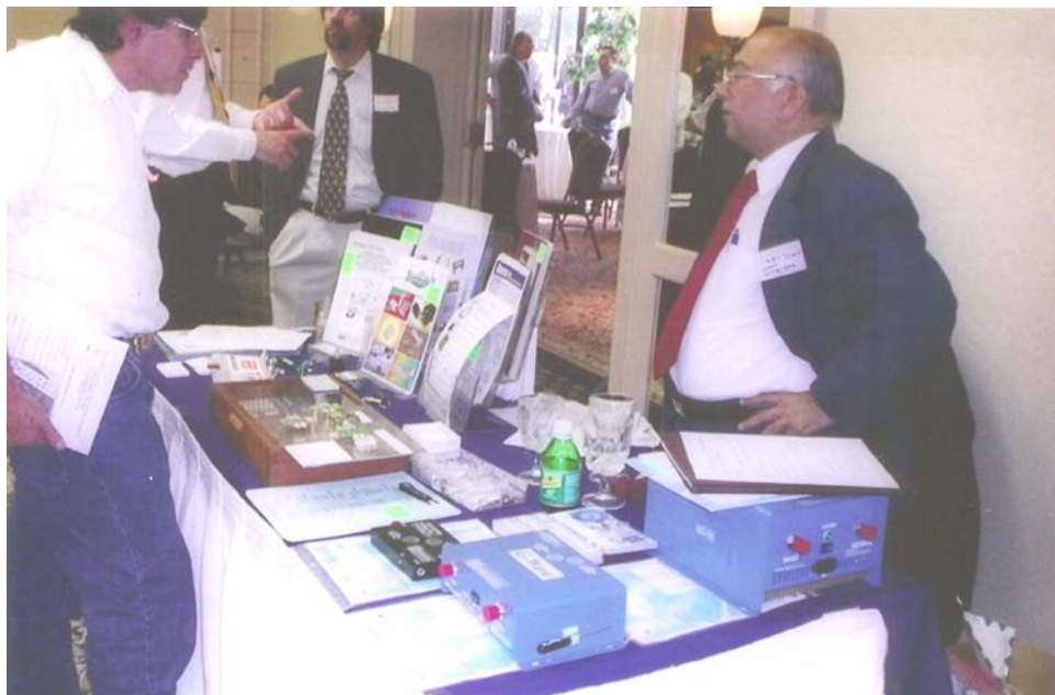
An abundance of technology and applications offered by exhibitors