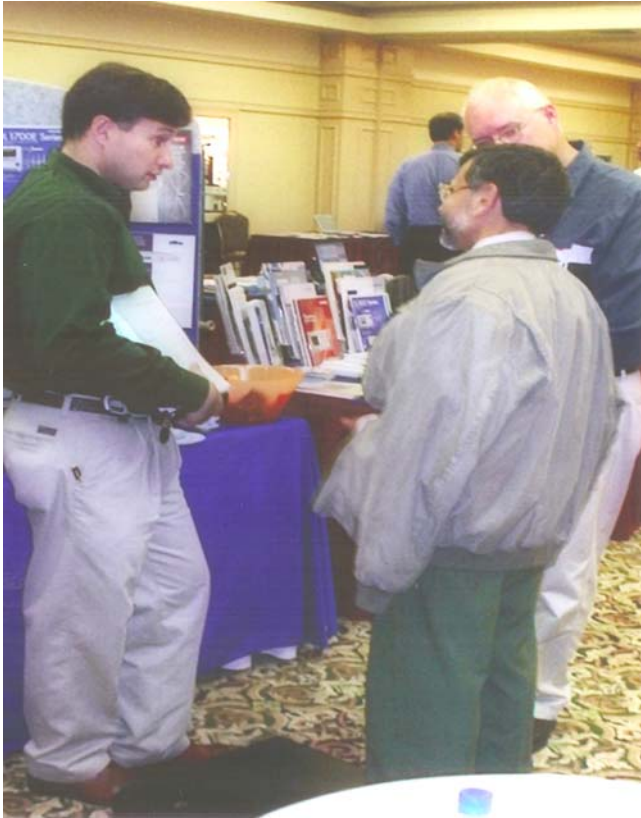
Sharing product information about new releases and upgrades