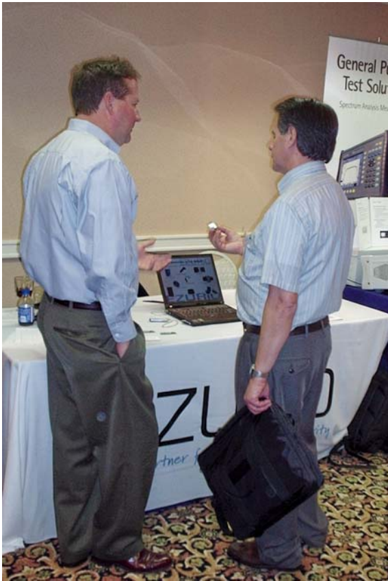
Exhibitors learned about customer needs and shared state-of-the-art Technology