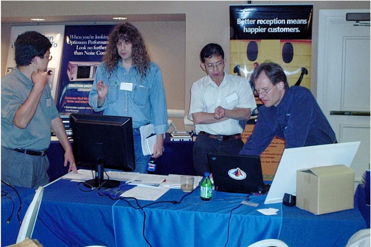
Interactive product demonstrations were an integral part of exhibitor displays