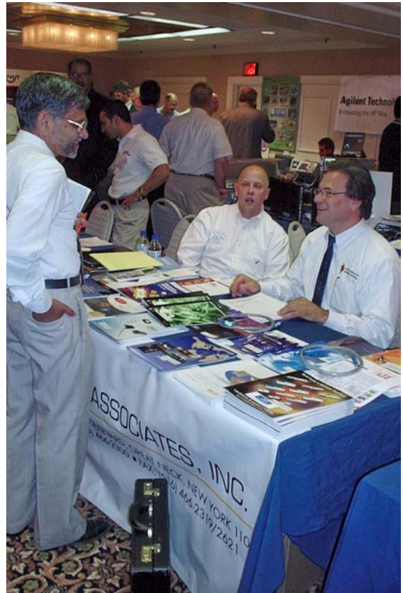
Exhibition area experienced heavy traffic