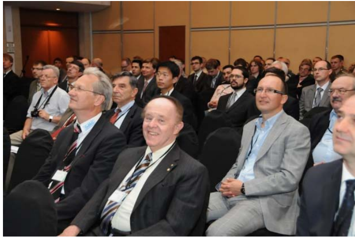
At IMS2012 in Montreal, June 2012