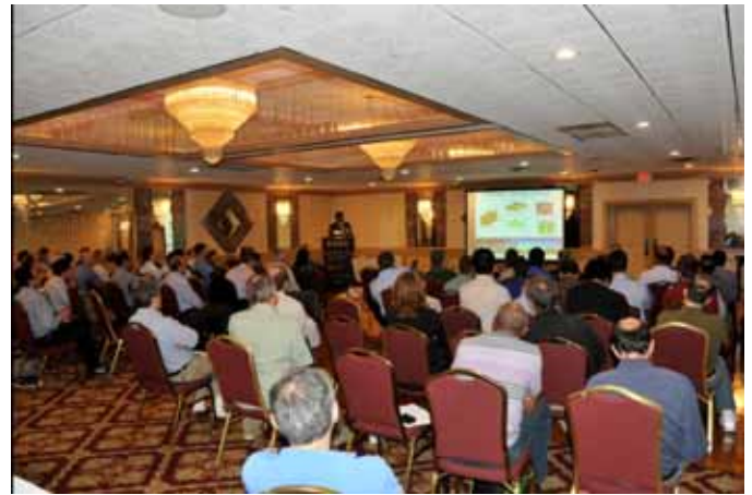
Symposium participants, listening to one of the presentations

The event was well attended and overall attendance was around 210.