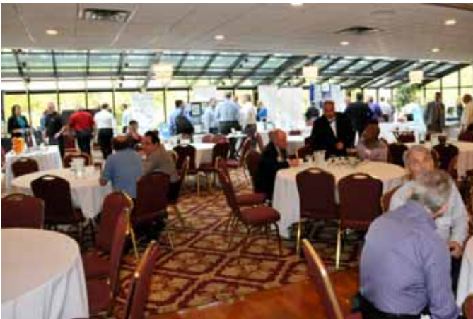
Exhibitions and coffee

This year the technical program was divided into roughly six presentations, each being about an hour long, by the speakers in lieu of the 30 minutes lectures in the past. We also had a number of "Distinguished Lecturers". The topics included Microwave Photonics, Medical Devices, High power Amplifiers, Oscillators, GaAn Devices and Antenna Propagation Theory.