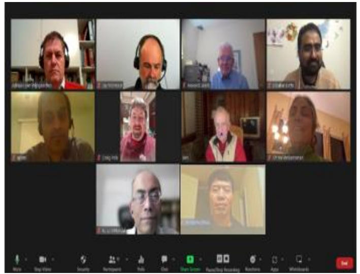
Fig. 1: January 2023 Hybrid ExCom Meeting