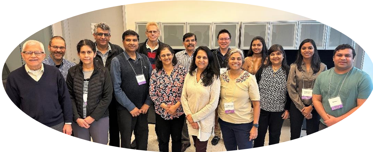
Fig. 1: IEEE North Jersey Section’s Team of Judges for the TNJSF IEEE