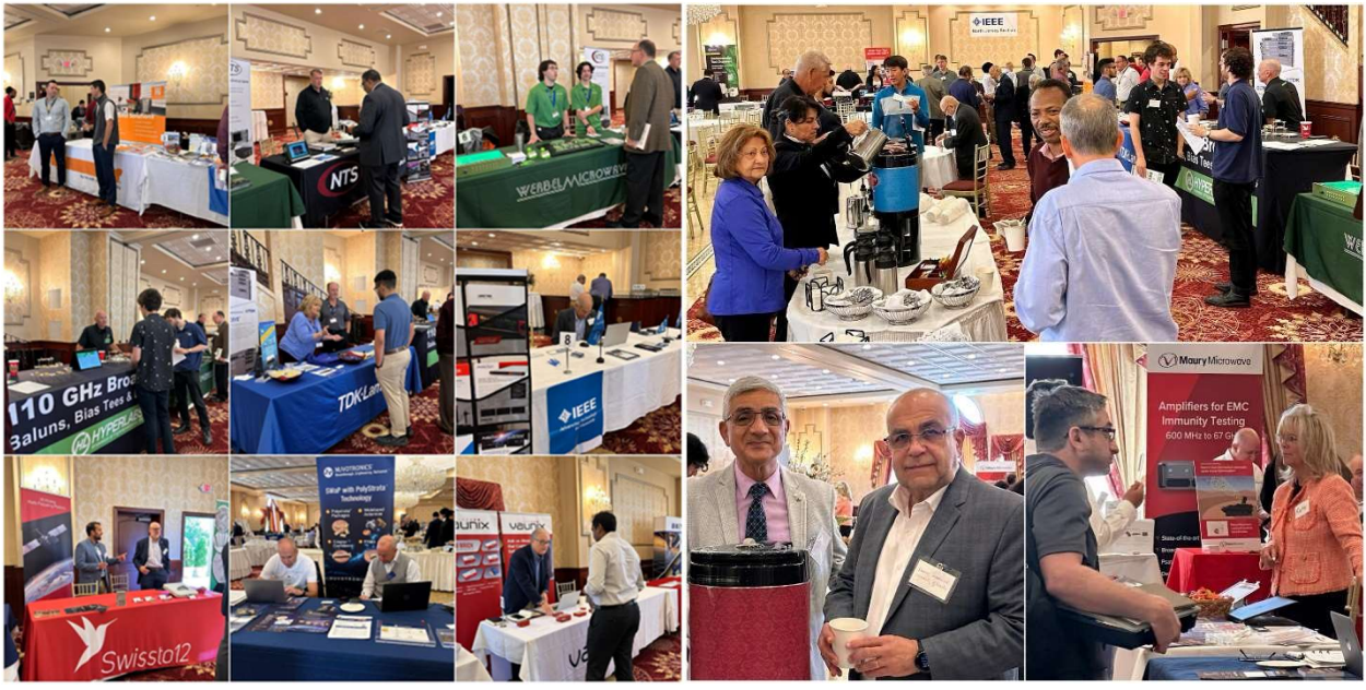
The Industry Showcase