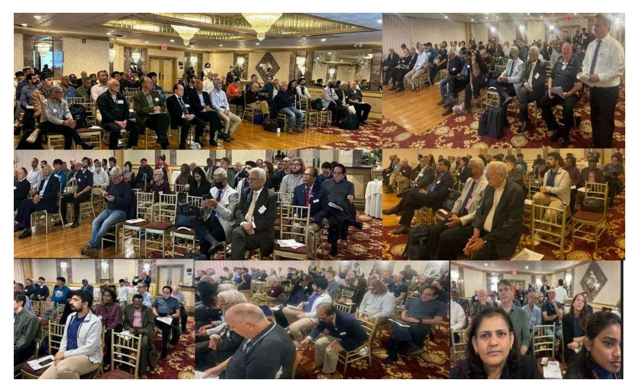
Attendees at the Technical Presentations